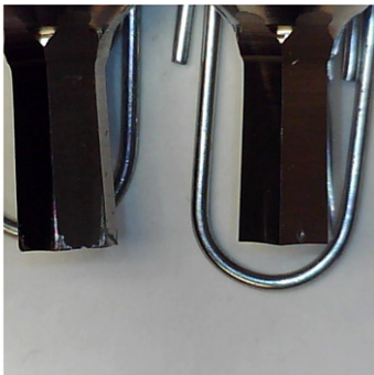
Hassay Max after machining 150 parts