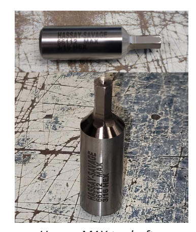
HassayMAX tool after machining 95 parts